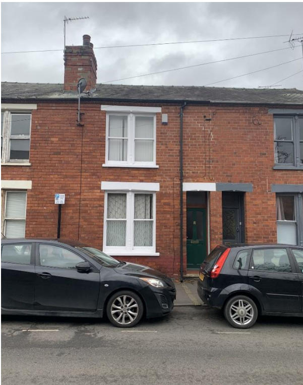
13 Union Road, Lincoln